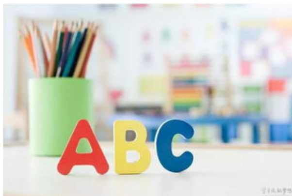
Figure 1 Stratified teaching

exercises in combination with the students' level ability, so as to lay a solid foundation for stratified teaching.