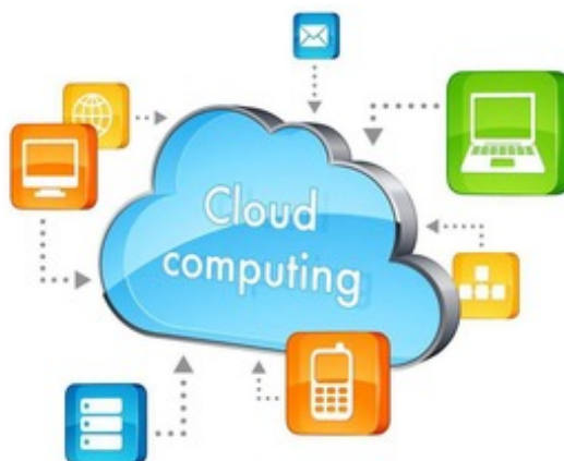
Figure 2 Stratified teaching

For example, when explaining reading comprehension, you can design different reading comprehension questions for students with different reading ability levels. Generally, there are three difficult reading comprehension questions after the college English test paper. In turn to increase the difficulty, reading ability of the weak students to conquer the general reading ability, reading ability of the general students to conquer the reading ability of the problem, and reading ability of the students to extend to him. Through a series of promotion difficulties, as well as teachers targeted guidance and points, can promote the continuous improvement of students' reading ability, so that students with weak learning ability can also experience the fun of success, but also help students build up their confidence in learning.